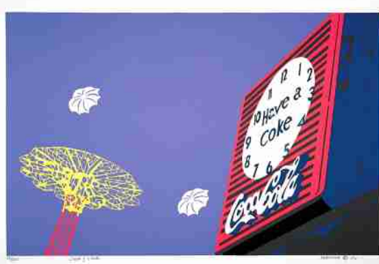
Clock & Chute , 1981 29.5" x 41.25"