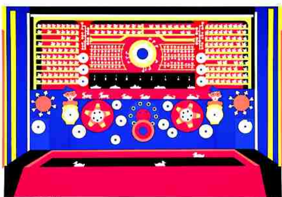
Shooting Gallery #2 , 1979 29.5" x 41.25"